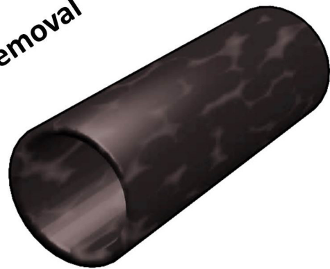
hollow 1D tubes of composite material